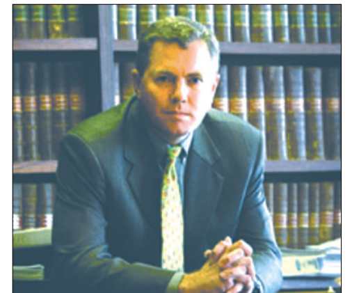
more page 2 Tony Morris QC

In 2004, a citizen who destroyed evidence by guillotining four pages of a notebook suffered the full force of the law and was given a suspended jail term.